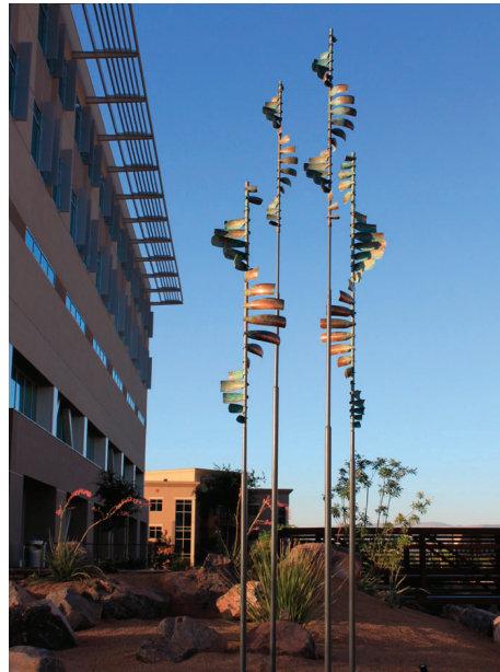
DRMC Health & Performance, St. George, UT.

Burning Man, Black Rock City, NV. Twenty-five elements (5-22 feet)