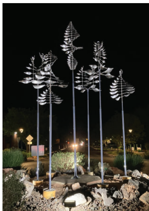
Art Around the Corner, St. George, UT

2002 Shapiro's Deli, Carmel, IN. Three elements (13-16 feet)