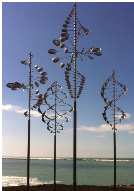
Buffalo City, NY

2000 Bennington Center for the Arts, Bennington, VT. Thirteen elements (13-22 feet)