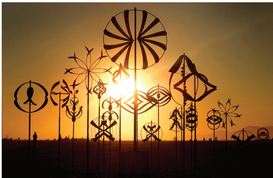
Kinetic Metamorphosis at Burning Man, Black Rock City, NV.

La Posada, Santa Fe, NM. Fifteen elements (10-23 feet)