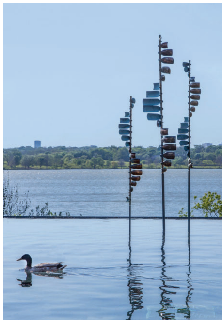
Dallas Arboretum, Dallas, TX.

Xetava Gardens, Kayenta, UT. Three elements (17-28 feet)