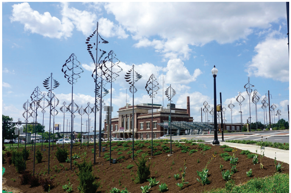
Lititz Pike Bridge, Lancaster, PA.

Exhibition at Dallas Arboretum, Dallas, TX. One hundred thirty-nine elements in 17 locations (3-23 feet)