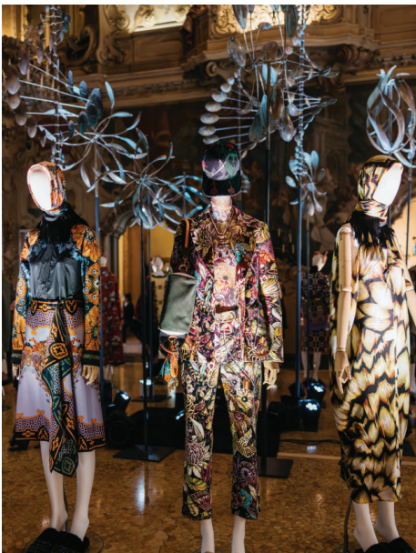
La Double J Fashion Show, Milan, Italy

City of Colleyville, Colleyville, TX. Three elements (8-17 feet)