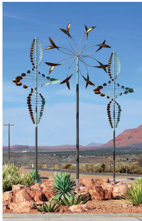
Kwavasa Roundabout, Ivins, UT.

City of Bullhead, Bullhead City, AZ. Thirty-three elements (5-12 feet)