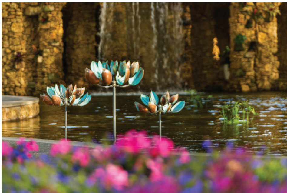
Dallas Arboretum, Dallas, TX.

Reid Hospital, Richmond, IN. Two elements (9-14 feet)