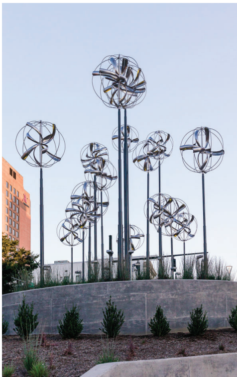
Merschel Park, Winston-Salem, NC.

ICN, Kilmarnock, VA. Eighteen elements (5-23 feet)