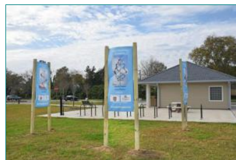
Lewes in Bloom and Art in Bloom volunteers placed banners in the approximate locations of three wind sculptures it plans to erect near the trailhead.

Checks payable to Art in Bloom may be mailed to P.O. Box 61, Lewes, DE 19958. Donate online at lewesinbloom.org ( http://lewesinbloom.org ) or greaterlewesfoundation.org ( http://www.greaterlewesfoundation.org ). Donations are tax-deductible. Lewes in Bloom and Art in Bloom are component funds of the Greater Lewes Foundation, a 501(c)(3) nonprofit corporation.